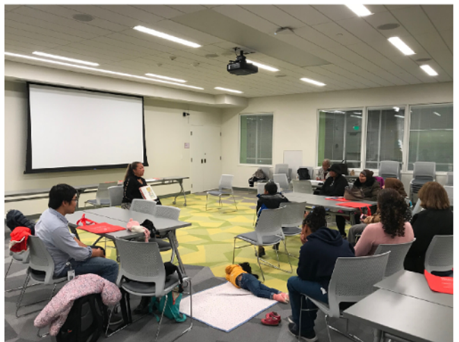
FAMILY LITERACY NIGHT