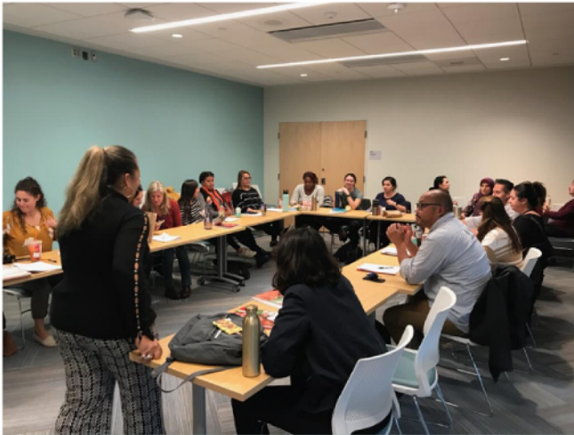
SRA READING MASTERY