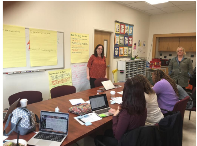
MATH OSS COLLABORATION