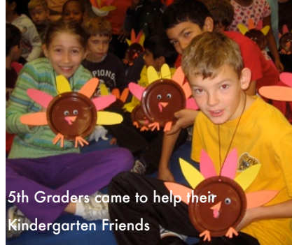
5th Graders came to help their Kindergarten Friends