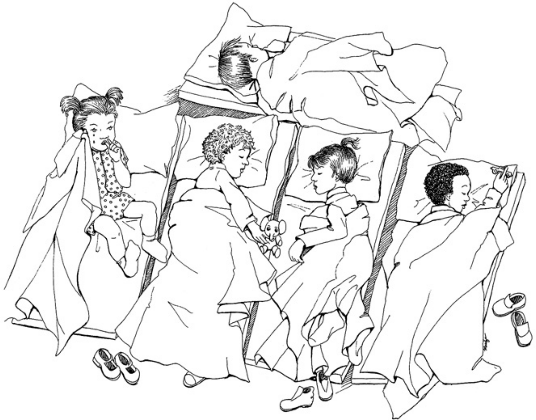
Illustration by Maritza Cantero