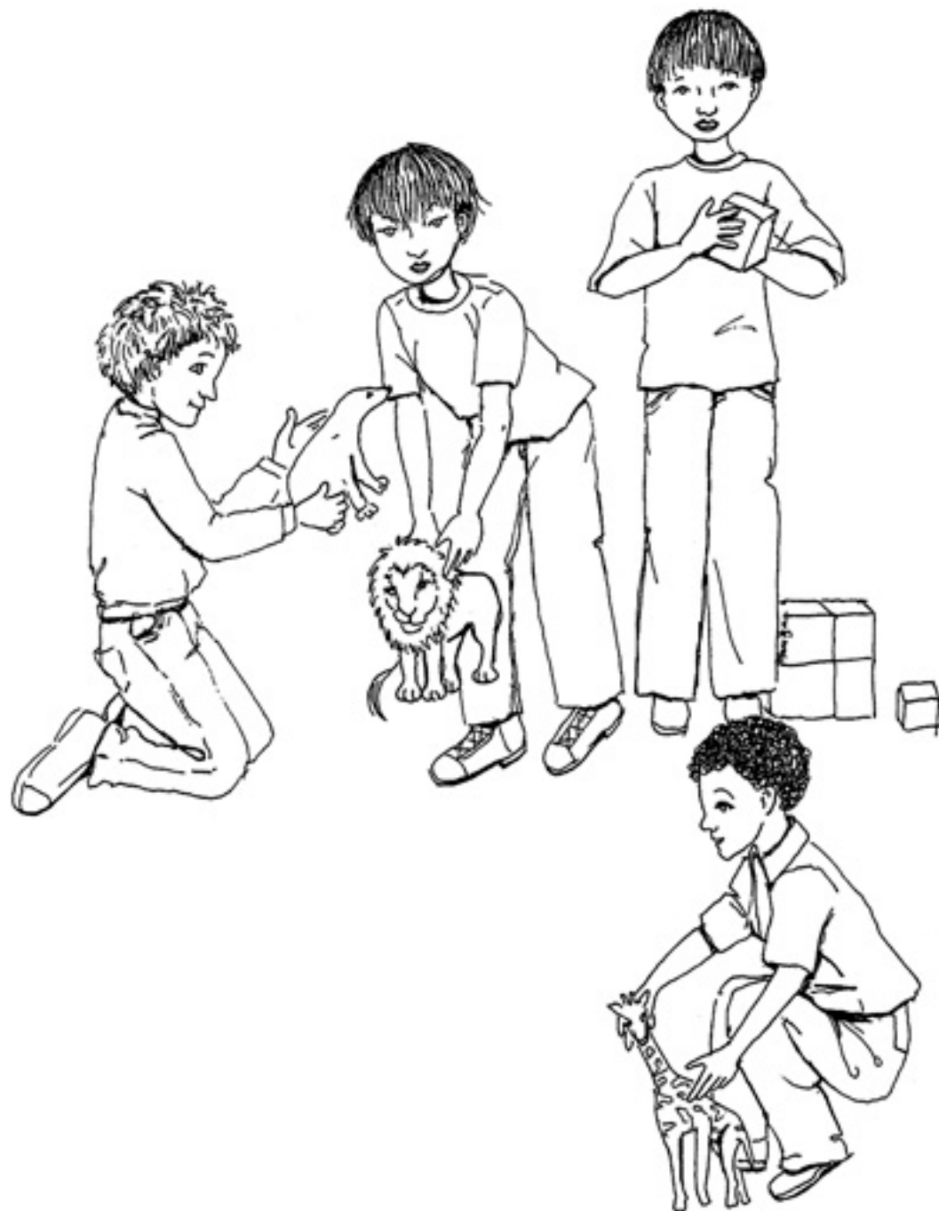
Illustration by Maritza Cantero

© Cambridge 0-8 Council / Cambridge Public Schools through Early Learning Opportunities Act (ELOA) Grant 2002-2004