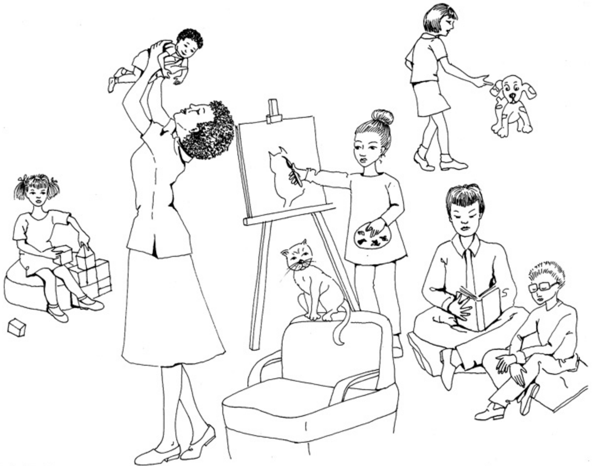
Illustration by Maritza Cantero

© Cambridge 0-8 Council / Cambridge Public Schools through Early Learning Opportunities Act (ELOA) Grant 2002-2004