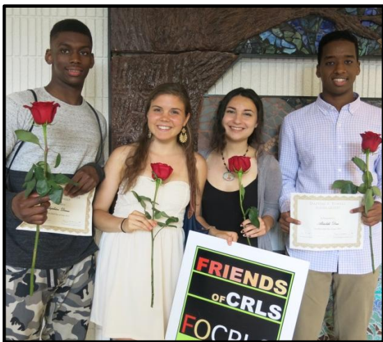
Four of the 24 members of CRLS's Class of 2015 who received FoCRLS Scholarship and Graduate Awards celebrate at the FoCRLS Reception on Scholarship and Award Night, June 22, 2015

Whether you're new to CRLS, continuing, or returning, Friends of CRLS (FoCRLS) provides a way to connect with other families, alumni, faculty, and more members of the extraordinary CRLS community. Working together to support the success of all CRLS students and seeing our group efforts have an impact is what makes our community meaningful.